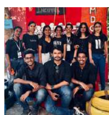
Band team, third prize