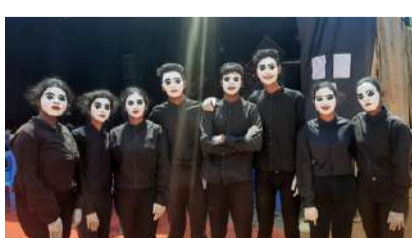
Mime team, third prize