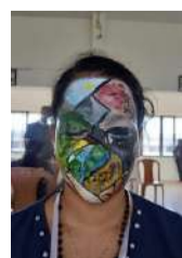
Second prize, face painting